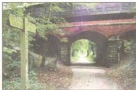
NUTBROOK TRAIL: The trail which runs between Long Eaton and Heanor is featured in the book.

Please add the word STOP at the end of your message if you do not wish to receive texts. Text lines are open now and will close at noon on February 4. Please note if you should enter after the stated closing date your entry will not be valid but you still may be charged.